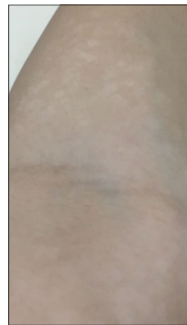
Figure 2: Hypopigmented macules over the arms after the second session of quality-switched 1064-nm neodymium-doped yttrium aluminum garnet for hair removal in a duration of 2 months