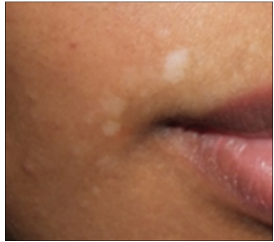
Figure 1: Hypopigmented macules after the tenth session of quality-switched 1064-nm neodymium-doped yttrium aluminum garnet for hair removal within 1 year duration

In the all four cases, the QS 1064-nm Nd:YAG hair removal sessions were performed in another clinic, and hence the parameters are not available.